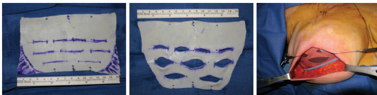
Fig. 1. Intraoperative images. (Left) An 8 × 16-cm piece of AlloDerm with planned fenestrations and trimming. (Center) Widely spaced fenestrations before AlloDerm placement. (Right) Tissue expander filled to greater than 50 percent with fenestrations between the subpectoralis and subcutaneous planes. A single drain is placed in the subcutaneous space.

and filled using a closed system without pectoralis muscle strain and with tension-free skin closure. A single 15-French round drain is placed in the subcutaneous plane (Fig. 1, right). Following complete tissue expansion, patients underwent implant exchange (Fig. 2), often with subsequent nipple reconstruction and tattooing (Fig. 3).