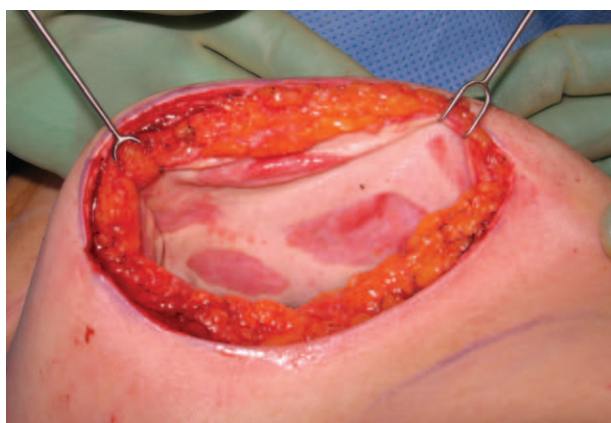
Fig. 2. Incorporation of fenestrated allograft with mastectomy skin flaps at the time of implant exchange.

The fenestrated and nonfenestrated acellular dermal matrix groups were unequal in size. Forty-two patients with two-stage reconstruction totaled 70 breasts. There were six nonfenestrated acellular dermal matrix patients (seven breasts) (five FlexHD and two AlloDerm) versus 63 fenestrated